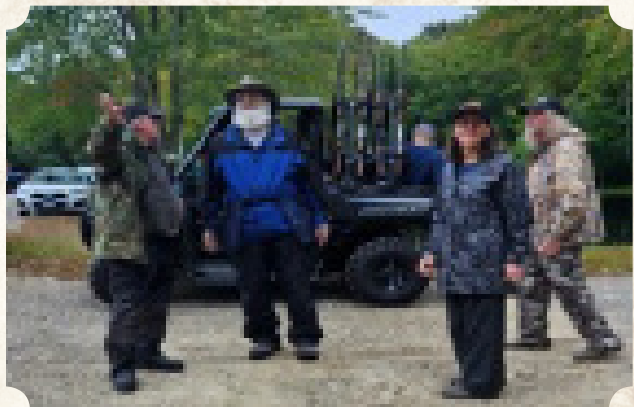
See, the sun will shine tomorrow.