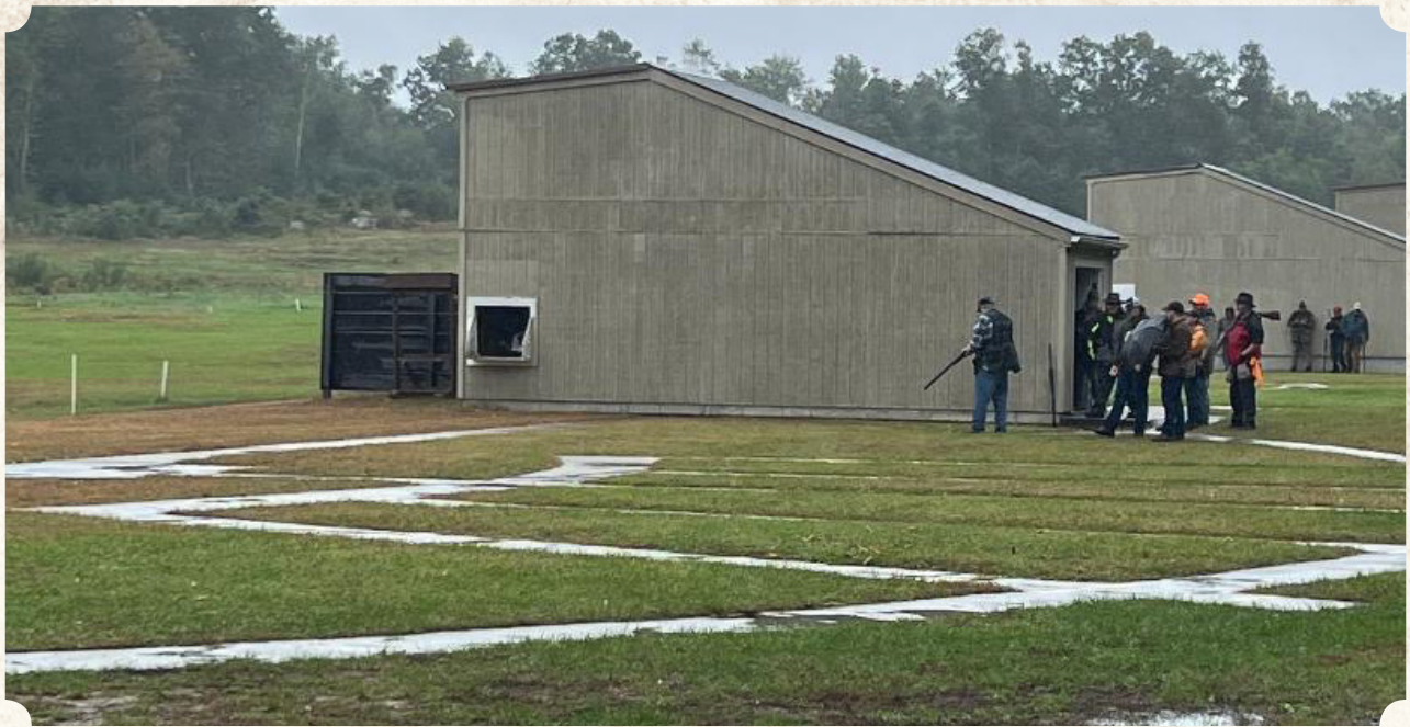
My feet are wet.