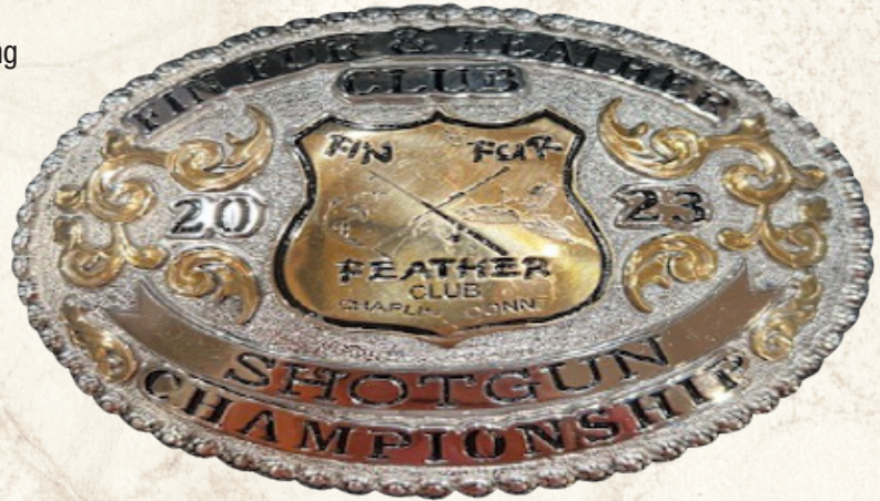
1st place buckle