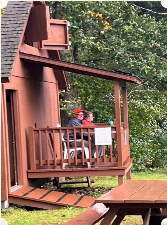
Was that a hit or miss?