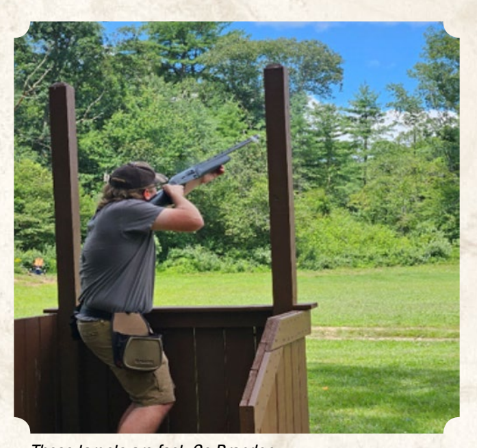
Those targets are fast, Go Brandon.