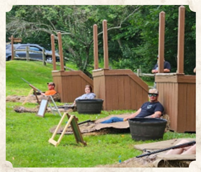
Shooting out of layout blinds