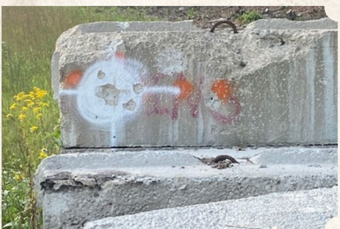
Crafty paint job.