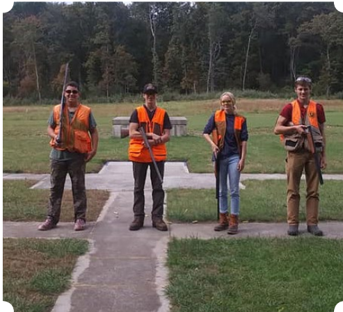
Junior Hunt Day Shooters