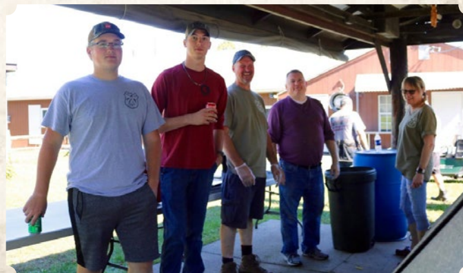
Some of our members helping to feed those hungry shooters. Thank you folks