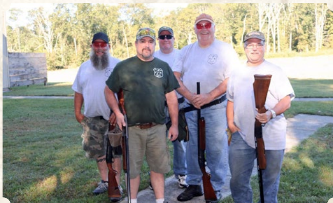
Few of the members shooting the Club Championship