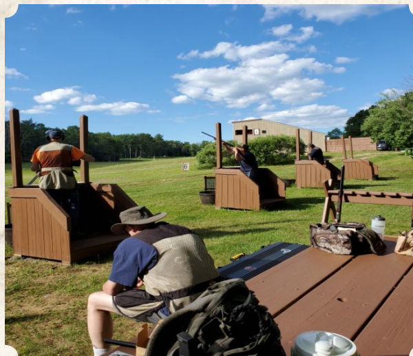
Members shooting 5-Stand