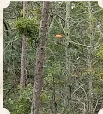
Target flying out.