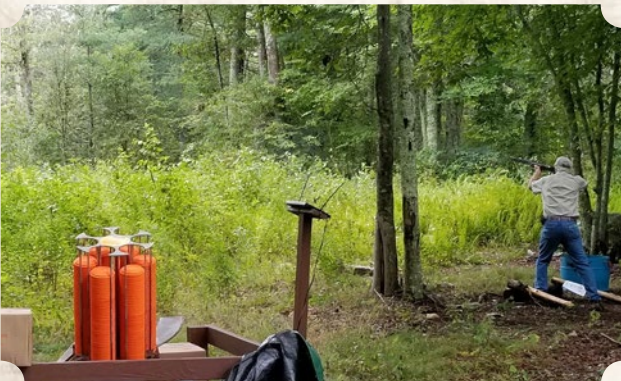
Shooter on the mark before yelling pull.

On Sept. 8th, Ducks Unlimited held their annual Sporting Clays at the Fin. 101 shooters in attendance enjoyed a shotgun start shooting 100 targets, a great meal put on by Ducks Unlimited, an award ceremony, and numerous raffles. Our Club has been hosting them for a number of years, and they enjoy our facility and hospitality. They have already booked the 2019 shoot.