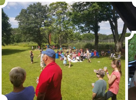
Everyone's keeping their distance from the Kids egg tossing contest.