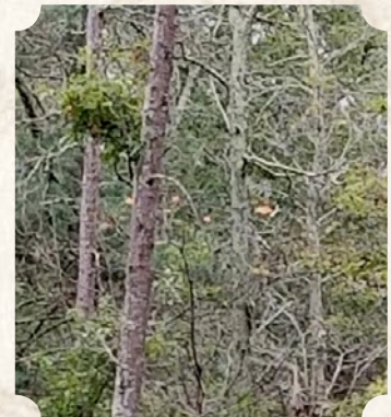
The target is broken.