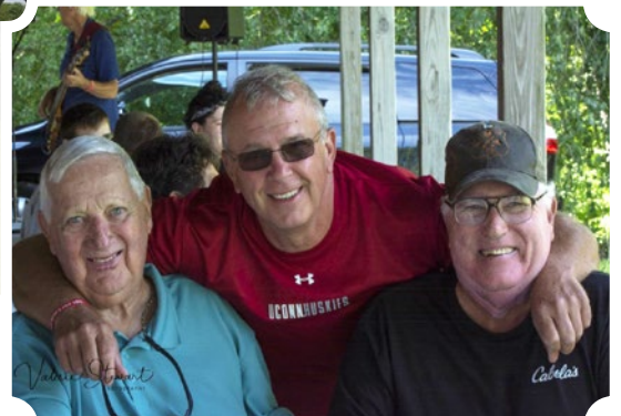
Here's some happy faces